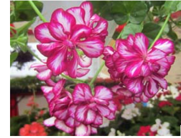
Above: some of the beautiful flowers donated by Bartlett's.