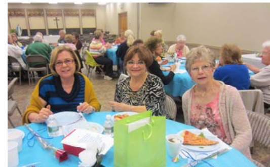
Far Right: Hospitality, Carnival Volunteer Presentation of Appreciation Awards