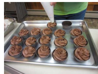
(above left) Elena's calorie-free (not) chocolate mousse cups