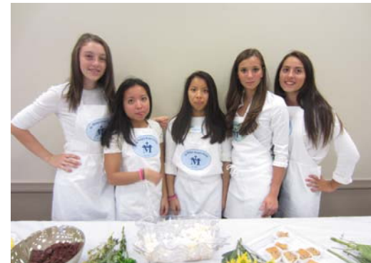
(Above) Our dedicated volunteers!