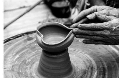
"Hands of the Potter"

Thursday, October 11 th at 7:00 PM in Church for prayer, guided meditation and reflection.