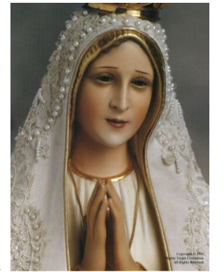
International Pilgrim Statue of Our Lady of Fatima

The world-famous statue was sculpted in 1947 based on the description of Sr. Lucia, one of the three young seers who saw Our Lady each month from May to October 1917 in Fatima, Portugal.