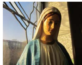
(Above) Picture of Our Lady with stained glass background taken in the Molloy Center Chapel.

Remember Our Blessed Mother during the month of May Pray the Rosary!