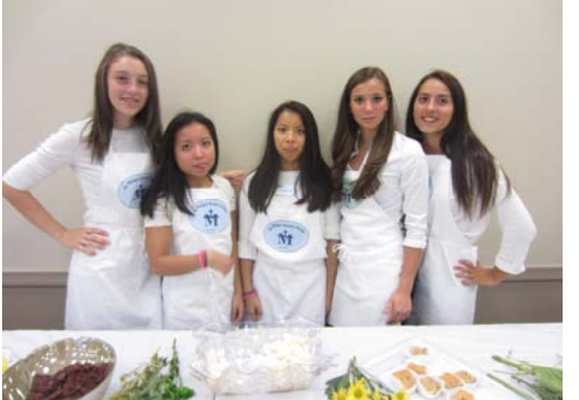
(Above) Our dedicated volunteers!