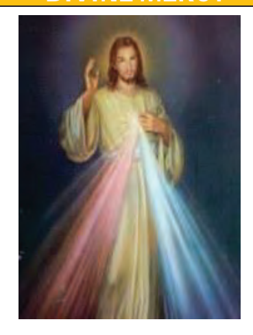
Join us on Sunday, April 7th at 3 PM

in the church for Holy Hour and recitation of the Chaplet of the Divine Mercy.